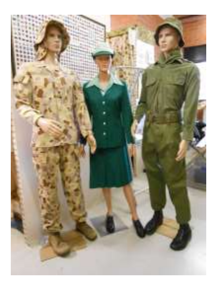
Uniforms destined for Seaton RSL display

Although the WRAAC uniform was retained it was now worn with buttons and badges from the relevant corps. The model is wearing WRAANC buttons and corps badge with silver sergeant's stripes. Prior to the "Prue Acton" uniform the Nursing Corps had its own identity and wore a grey service dress. This uniform was later phased out with women wearing the same style service dress, jungle greens or camouflage uniforms as the men. In 1965 the Army made the decision to allow married women to continue their service and in fact I was the first WRAAC in South Australia to do so with the CMF/ARES leading the way and the Regular Army following a couple of years later. This progressive move also resulted in a maternity smock being introduced as part of the female uniform. A recent newspaper article reported that the Army now recognises that women are not just smaller men and working dress such as boots and cams will now be manufactured to suit the female form. As Maurice Chevalier once said "Vive la difference"!