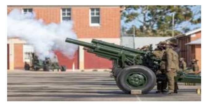
A 'birthday' salute to the Artillery Corps performed on the parade

The Australian Artillery marked its 150th anniversary on August 1 – a century-and-a-half of continuous service. By the end of 1870, as British forces withdrew, the separate colonies of Australia each became responsible for providing its own defence. Prior to 1871, all Australian colonies had their own volunteer artillery batteries to augment permanent garrisoned British forces. The departure of the British batteries meant the loss of artillery technical proficiency. Colonies needed their own permanent artillery forces to sustain the necessary expertise, particularly for the defence of their ports. The story of today's Australian Artillery originates on August 1, 1871, when the NSW Colonial Government funded and raised its first permanent battery. Officers, gunners, guns and equipment formerly with the original NSW Artillery Battery helped form subsequent batteries in 1876 and 1877, serving as both garrison coast artillery and mobile field artillery. Army's longest continuous serving permanent unit is A Battery, currently part of the 1st Regiment, Royal Australian Artillery. A Battery traces its history to that original NSW Battery. Soon after, the other colonies raised permanent batteries to complement their volunteer and militia batteries, as the demands for self-defence grew across Australia. Eighteen