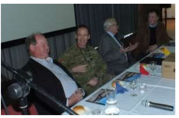
Our History Lunch speakers May 2021