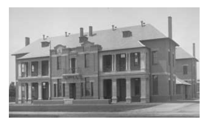
Building 64, now soldiers' accommodation, became to the Army

If you would like to learn more of the history and double use of Keswick Barracks buildings, book a place for the Keswick